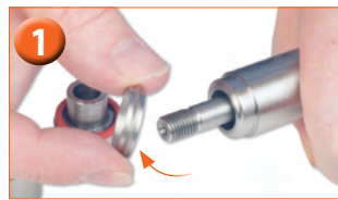
Stop ring chamfer

The parf super dog can be assembled in two configurations.